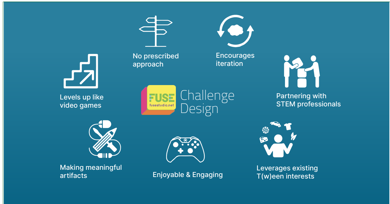
THE KEY PRINCIPLES THAT GUIDE THE DESIGN OF OUR CHALLENGES.

FUSE Challenges are designed to be appealing to any student, including students with little prior expressed interest in STEM. We design our challenges to reach across the gender and interest spectrum. Our goal is to meet students wherever they are in their learning pathway and to sup-